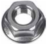
Flanged hex nut MU F