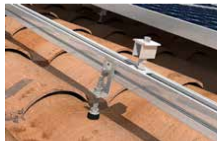
Detail: stud screw STSR with bracket MW SA