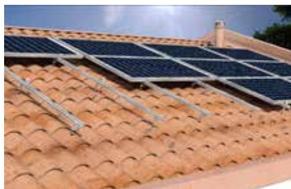
Special application on pitched roof