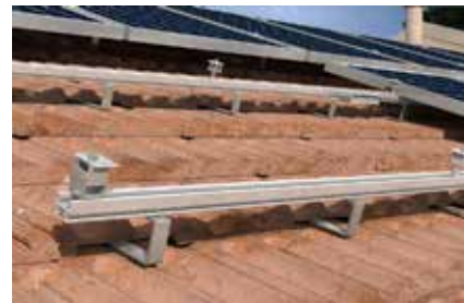
Detail: Profile Solar-light