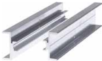
Joint CPN AL